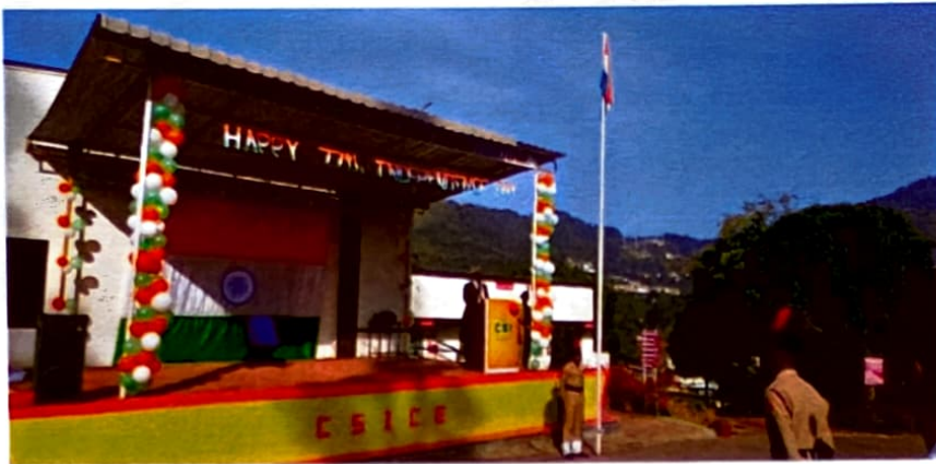
Principal giving Independence Day speech