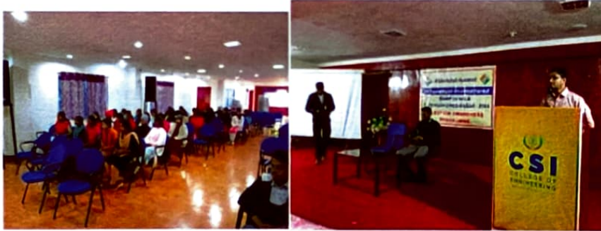
Electoral Awareness Program

The program effectively educated students about their electoral rights and responsibilities, encouraging active civic participation.