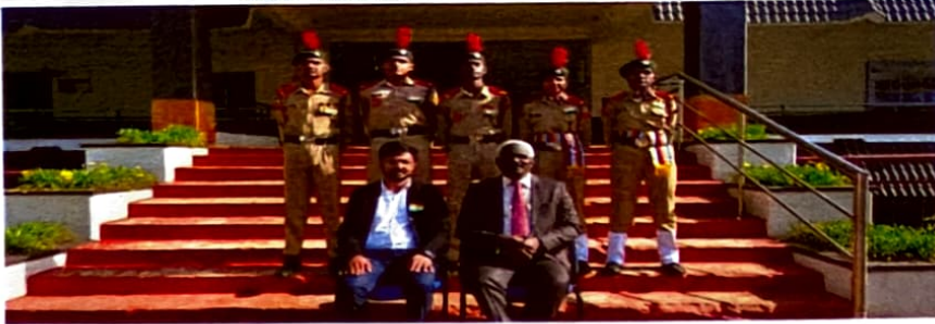
NCC Cadets with the principal and faculty coordinator