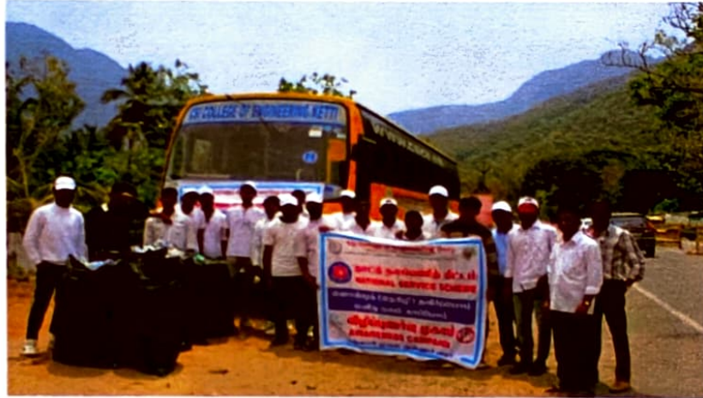
NSS Volunteers with Cleaning Plastics & Awareness campaign poster

Volunteers distributed the leaflet which contains the informations on ban on plastics and effect